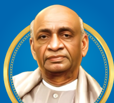
Sardar Vallabhbhai Patel